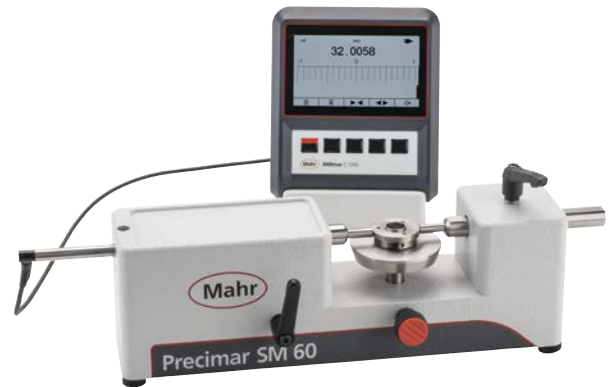
Shown with optional C 1200 and P 2004 M