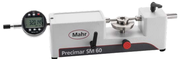
Shown with optional MarCator 1086